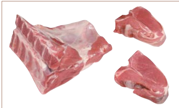
SHORTLOIN - H.A.M. Code: 3170 and CHOP