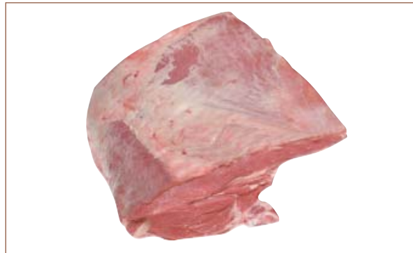
RACK - H.A.M. Code: 3209