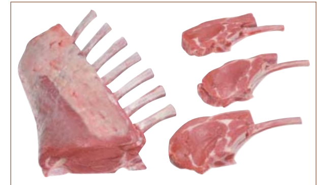
RACK FRENCHED and CHOP