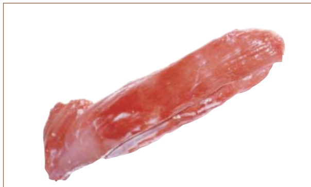
TENDERLOIN - H.A.M. Code: 3330