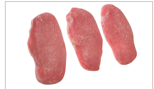
EYE OF SHORTLOIN STEAK