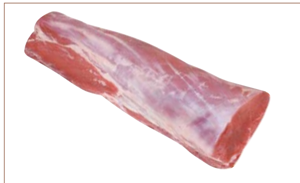
BACKSTRAP (EYE OF LOIN) - H.A.M. Code: 3440